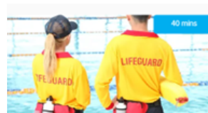
Lifeguard Advanced Supervision Skills